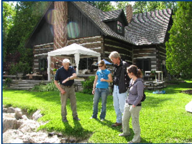
A lakeshore resident discusses his shoreline concerns with program staff.

Working together to protect and restore the Lake Simcoe watershed.