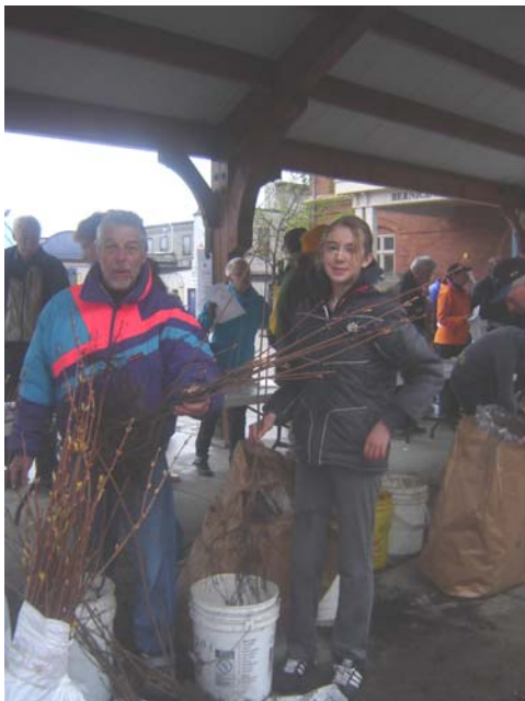
Community Tree Event City of Belleville

In 2010 the Hastings Stewardship Council partnered with Municipalities of Belleville, Tweed, Stirling-Rawdon, Marmora and Lake, and Centre Hastings to provide 12,000 tree seedlings to residents of these communities to encourage tree establishment in residential areas.