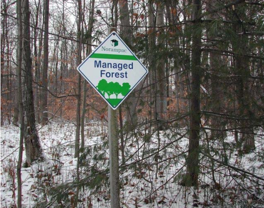
Norampac Managed Forest

The Trenton Woodlot Conference is an opportunity to gain the latest insight into woodlot management techniques, hear about forestry association updates, or take an informative hike through a local woodlot. Each year this conference offers new information and an opportunity for woodlot owners to renew old acquaintances. Almost 200 woodlot owners took the time to attend our premiere woodlot event in November 2010.