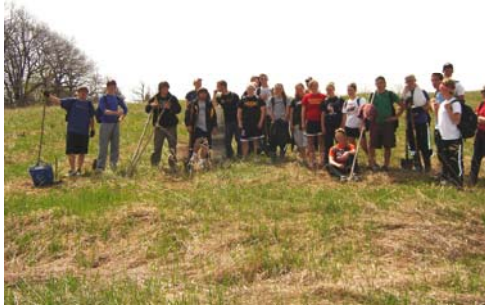
Certified Tree Planter Program Trenton High School