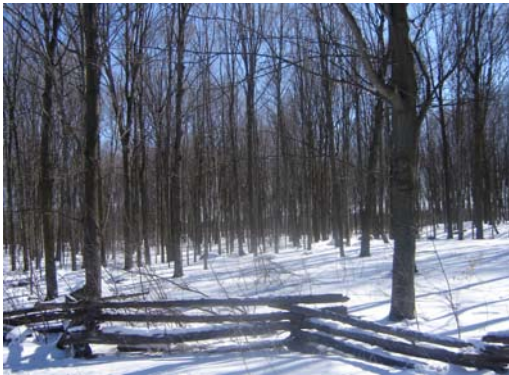
Productive forests are key to Hastings County forest based economy

Hastings County has historically and still supports today, a strong forest-based economy. There are about 168,000 hectares (415,000 acres) or 48% of our land base classified as wooded private land.